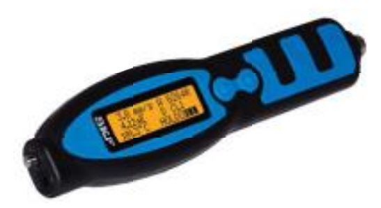
SKF Machine Condition Advisor, CMAS 100-SL.