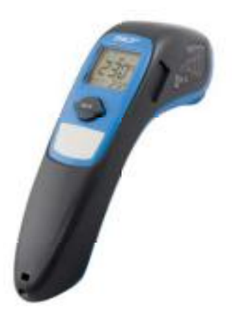
SKF Infrared Thermometer, TKTL 10.

The CMAS 100-PROMO is a machine check bundle that features two instruments: the SKF Machine Condition Advisor (CMAS 100-SL) and the SKF Infrared Thermometer (TKTL 10).