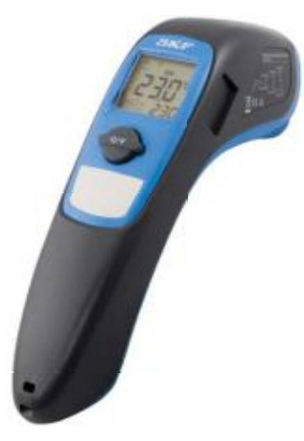
SKF Infrared Thermometer TKTL 10.